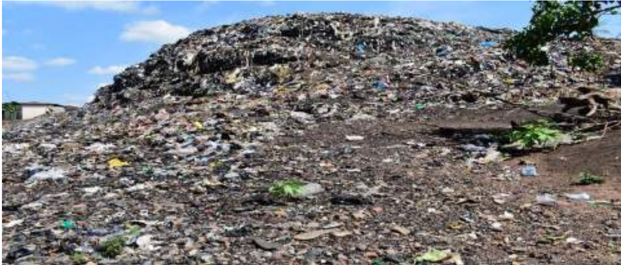
Heaped Refuse Dump at Ntonso