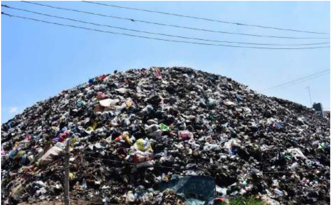
Heaped Refuse Dump at Meduma